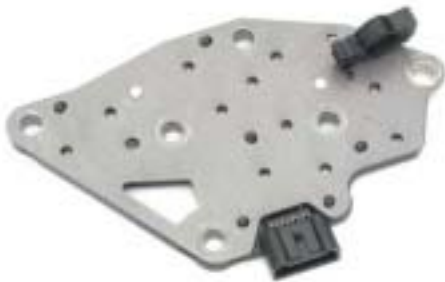
Early style PSA with Six switches

The new design PSA and wiring harness will not back service the previous applications as the valve body machining has drastically changed. The part number for the previous design PSA is 24203699, the part number for the de-contented PSA is 24216426