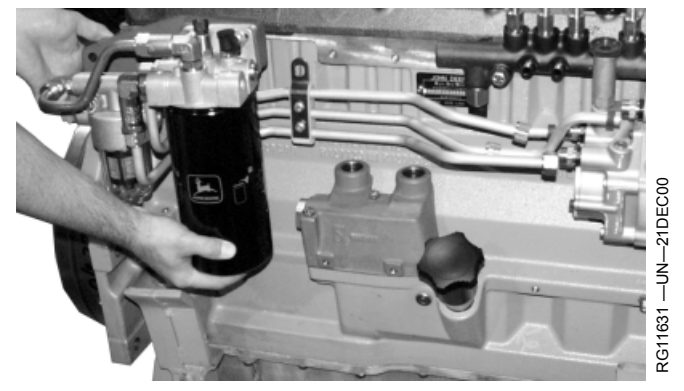
Remove Fuel Filter Assembly (-246269)

10. If engine is equipped with a dual fuel filter system, go to step 13. If equipped with a single filter element, loosen the fuel line clamp located behind the oil filter.