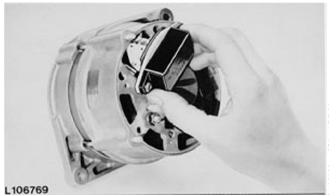
Remove Brush Holder with Regulator

NOTE: Before dismantling alternator, first remove brush holder with regulator so carbon brushes will not break during disassembly.